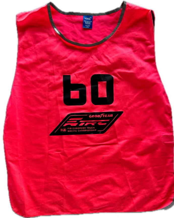
Trackside media tabard